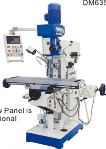
New Panel is Optional