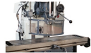
Main spindle protection (Optional)